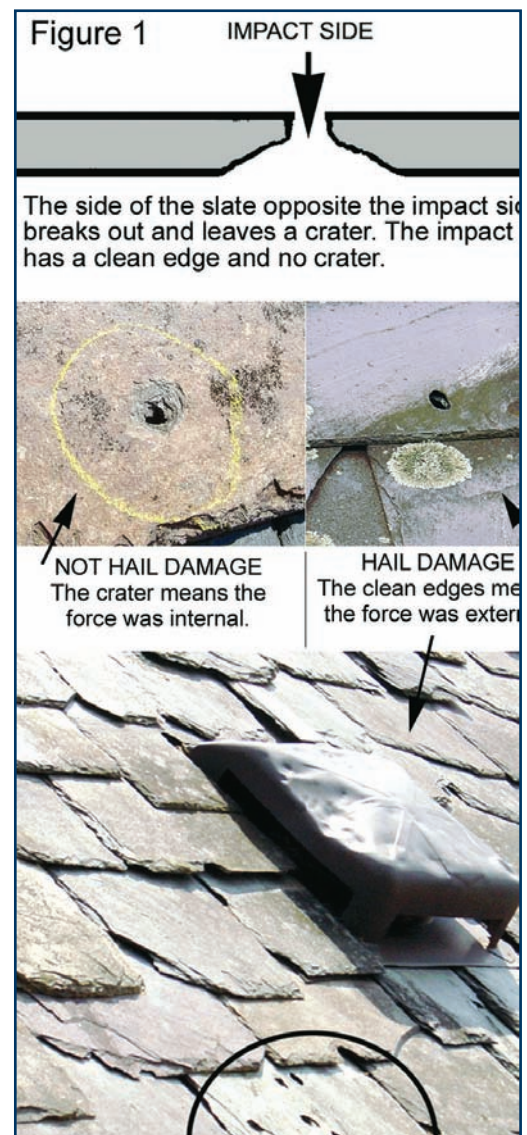
Figure 1 - When slate is perforated, the impact leaves a clean hole on the impact side and a cratered hole on the opposite side of the impact.

Another way to assess the amount of hail impact on a roof is to examine the metal components for indentations. For example, Figure 2 illustrates hail impact indentations on low-slope copper roofs after severe hail events. These roofs are in New Orleans and Chicago. Figure 3 illustrates hail damage to a graduated slate roof in Indianapolis. Although the slates were 1/2 in to 3/4 in thick Vermont slates only 75 years old, some were perforated by huge hailstones.