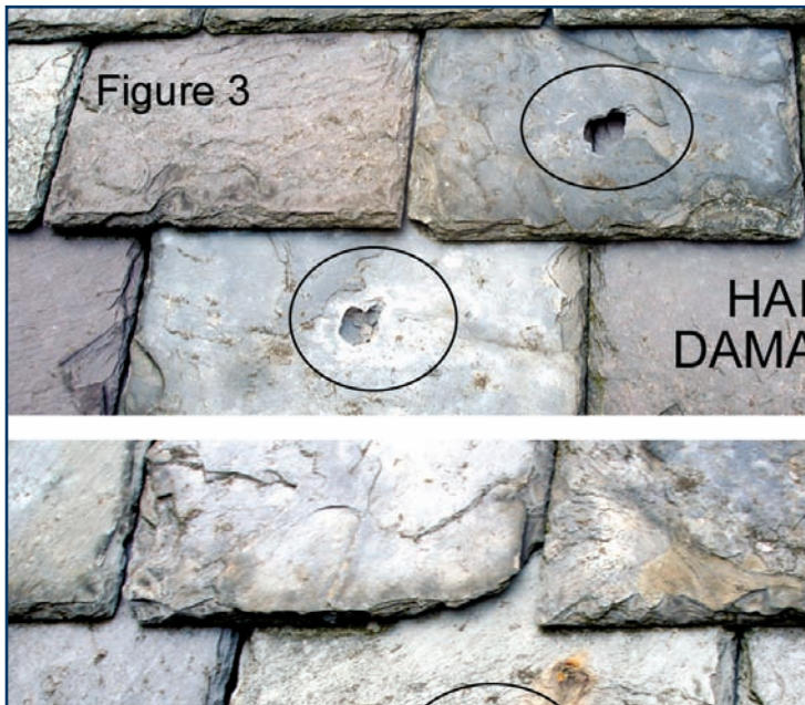
Figure 3 – Hail-perforated slates should simply be removed and replaced. Hail damage rarely justifies replacement of an entire slate roof.