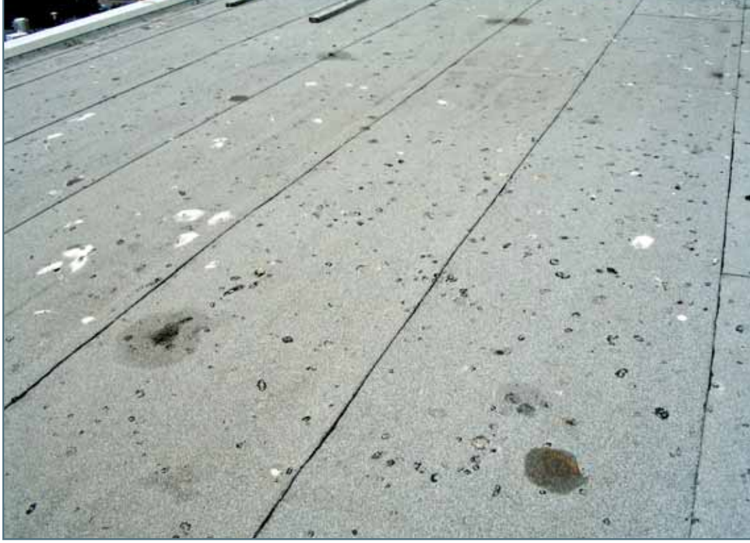
Photo 6 – This photo was taken after the roof had been well washed by rain. The small, round marks are typical of granule loss damage to modified bitumen membrane caused by gull droppings. The larger, “splotchy” marks exhibit damage to the actual membrane, down to the reinforcing, in some locations. Some of what these birds eat and defecate dissolves or softens asphalt!