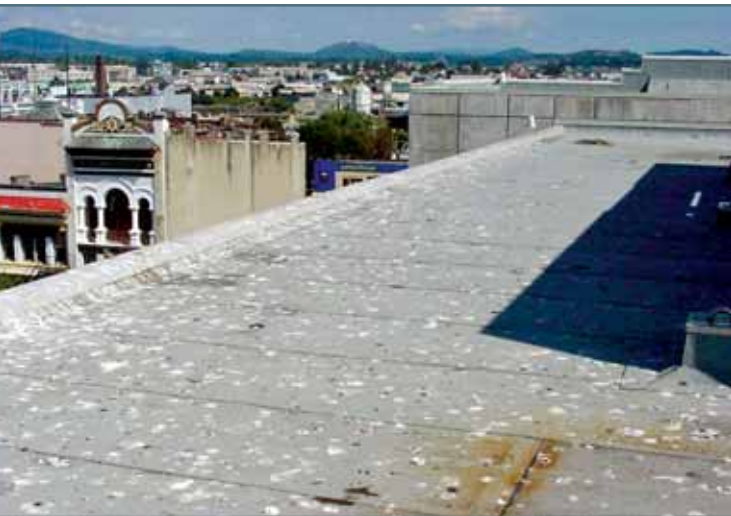
Photo 2 – The amount of fecal matter and damage discovered on the first site visit was quite astonishing... and the smell wasn't great either!