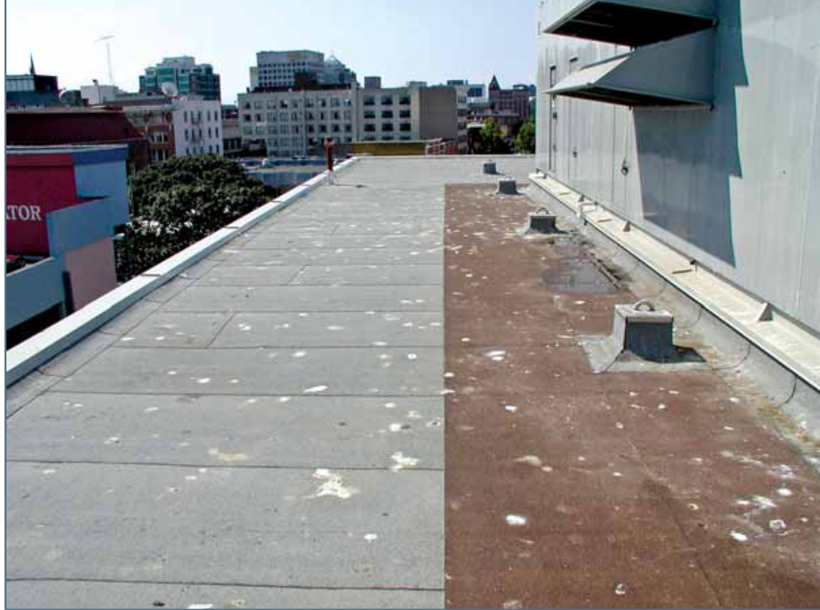
Photo 4 – Given the amount of fecal matter, a dry weather spell, and then a rainstorm, the air intakes can (and did!) draw some very objectionable odors into the building, to say nothing of the bacterial problems.

In this particular investigation, certain facts seemed to synergistically combine to cause the severe damage. The location of the building, the weather condi-