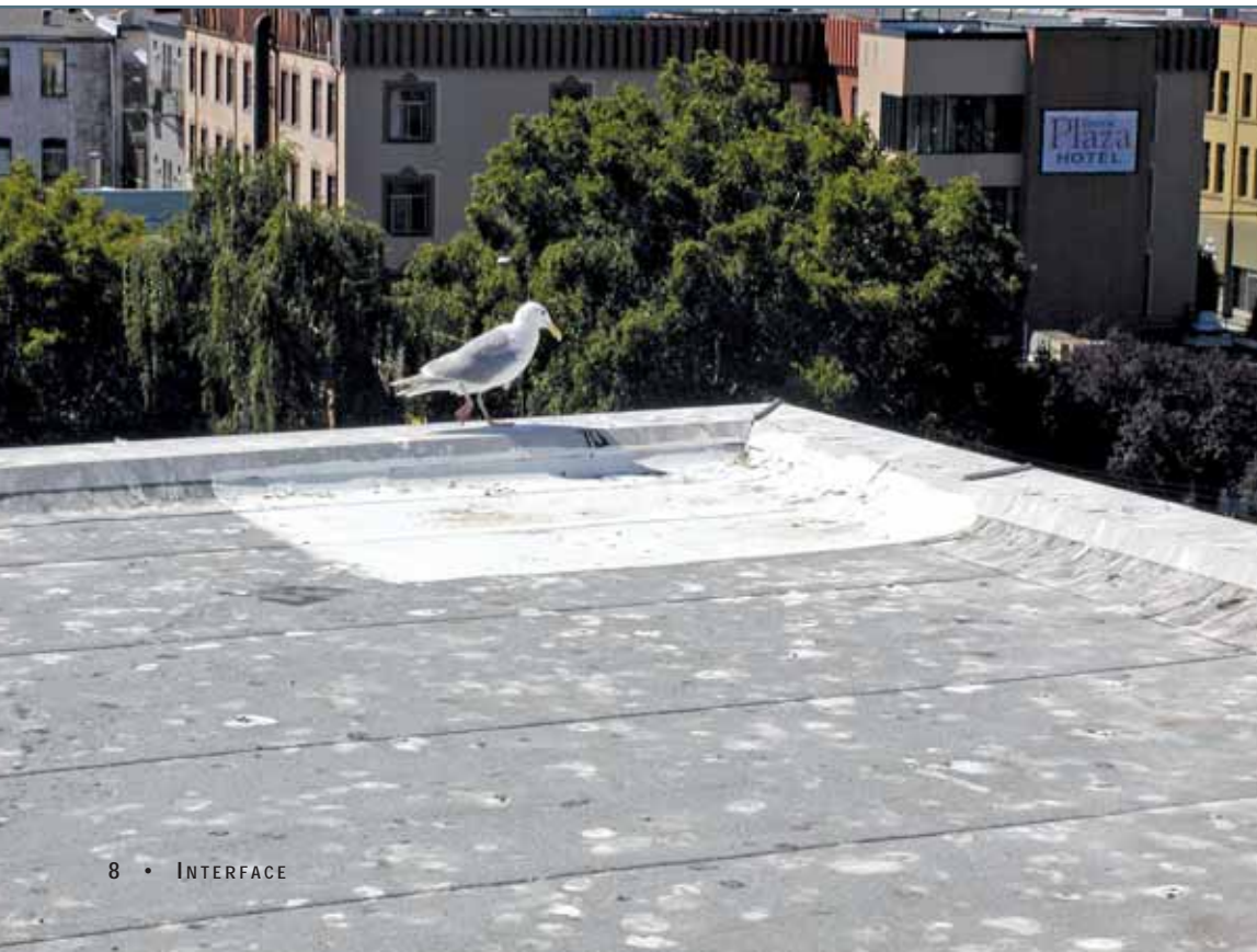
Photo 5 – One of the attempts to “fix” the problem was an elastomeric coating. As demonstrated, the birds loved it. This particular coating proved ineffective.

“The roof membrane on the building is, generically, a 2-ply, SBS, modified bitumen membrane system, with the top