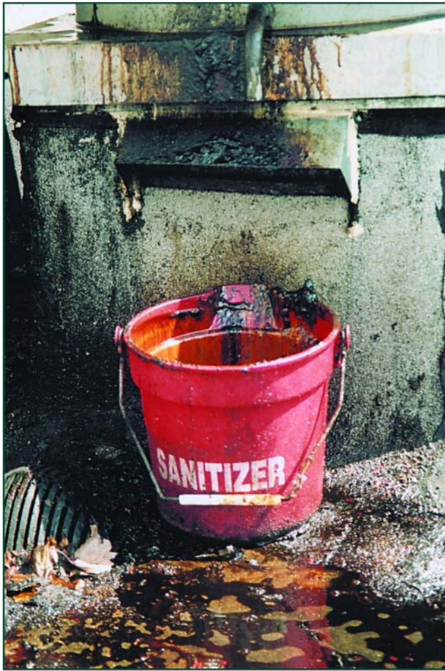
Photo 2: Rooftop grease spilling into a roof drain is stormwater pollution.

On the industry side of stormwater permits, approximately 1,400 groups applied for permits, which made it difficult for the EPA to produce group permits. To resolve the problem, the EPA issued the Multi-Sector Stormwater General Permit (MSGP). The MSGPs established 29 different industry sectors. The EPA further subdivided many of these sectors into 70 sub-sectors. The MSGPs became effective on September 29, 1995. The original industry groups with coverage under a BIGP were given until March 29, 1996, to apply for a MSGP. However, a MSGP does not cover all industry sectors and the EPA is currently evaluating the industry sectors for the MSGP program. The proposal is published in the Federal Register , Vol. 62, No. 133, July 11, 1997. More information regarding each industry sector and requirements for compliance can be found at Federal Register , Vol.60, No. 189, September 29, 1995.