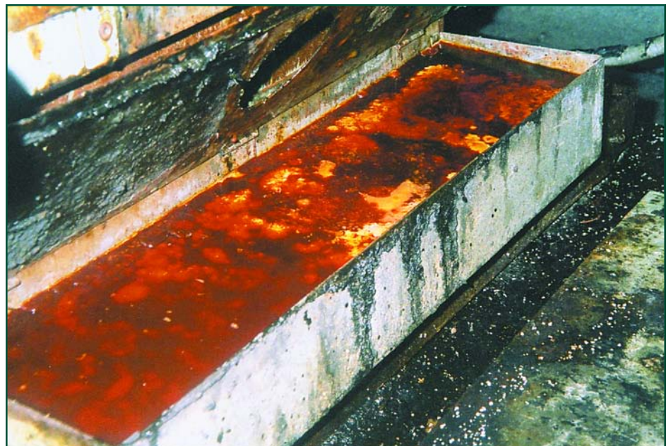
Photo 5: A collection box full of grease that is about to overflow.

As the roofing industry knows, restaurants and food service establishments have special roofing needs. A roof can not be