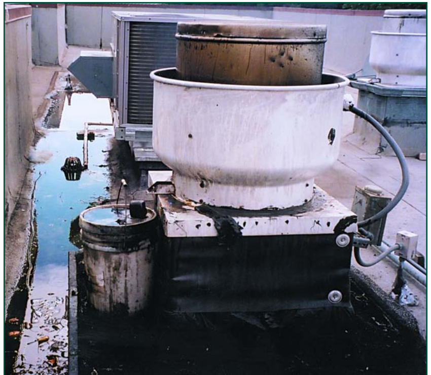
Photo 1: Grease spilling from a typical rooftop exhaust fan that does not have proper grease containment product in place.

For a recent case history, look no further than Los Angeles, California. This past summer, restaurants in the City of Los Angeles were spared the requirement of installing costly underground interceptors for the disposal of fats, oil, and grease. Thanks to efforts by California Restaurant Association Government Affairs' staff, the City changed its proposal to require that all restaurants follow Best Management Practices in the disposal of fats, oil, and grease (FOG). Nationwide, the food service industry has the same problem of rooftop grease disposal. All industries that generate and discharge FOG and other potential pollutant sources are faced with the Environmental Protection Agency's (EPA's) Stormwater Pollution Prevention Plans and Best Management Practices.