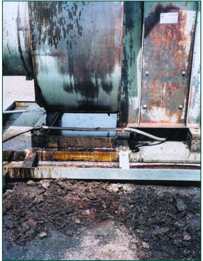
Photo 3: Roof damage caused by installing the improper grease containment product.

SWPPP requirements are designed so that small businesses may develop and implement a pollution prevention plan. However, obtaining services from a qualified consultant is another alternative in preparing a SWPPP. For more information regarding the stormwater program, call the EPA or Department of Environmental Quality.