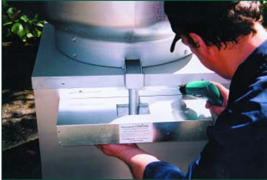
Photo 6: This GAP-1398 Side Mounted Drip Pan is equipped with a disposable Grease Diaper. The equipment has a water drainage system that allows rainwater to flow without spilling grease onto a roof. (Lids are optional.)

designed to be immune to the effects of FOG, but a designer can control how to collect and trap FOG better. The industry needs to start using the proper grease containment products. Property owners and managers need to be more vigilant when it comes to enforcing and maintaining these systems. When inspecting a roof, always make sure there is proper grease containment protection in place.